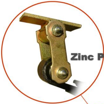
Zinc Plated Shackles *